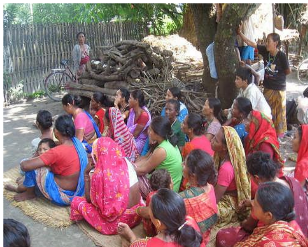
Literacy Class - Sunsari

We manage this by running Project Ujyalo Bhabisyia (Project UB) - meaning ‘A Brighter Future’ - which focuses on supporting socially and economically marginalised individuals through a programme aimed at education, empowerment and income generation. Since 2000 over 2,500 individuals have benefited from directly engaging on a daily basis with Project UB activities.